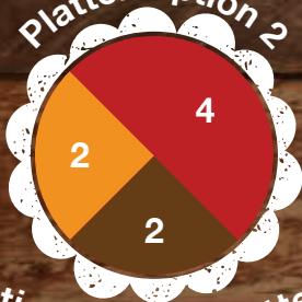
Platter Option 2