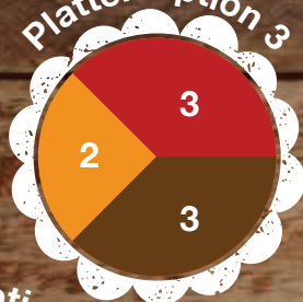
Platter Option 3