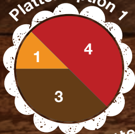
Platter Option 1