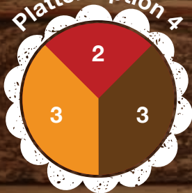
Platter Option 4